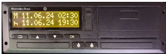
Image 1: on the left shows that time of manual entries begin at 02:30 hours. Driver has been on daily rest as rest mode (bed) is selected on the same date until 19:30 hours.

In the following example, driver took his digital card out at 02:30 hours and inserted again the at 19:30 hours. What was he doing during the time in between?