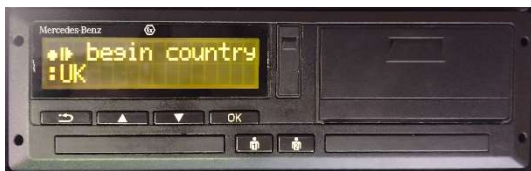
Image 4: on the left shows that driver selects UK as the country where his driving begins.