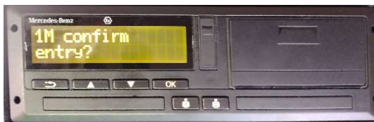
Image 3: on the left shows that driver confirms the entries he added.