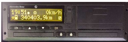
Image 5: on the left shows that driver has pressed ok button at 19:51 and no more additional entries.