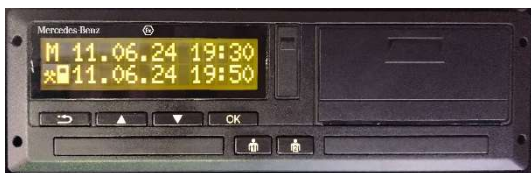
Image 2: on the left shows the driver has to select a mode on same date after inserting digital card from time 19:30 to 19:50 to record the activity. He selected other work as shown by hammers.